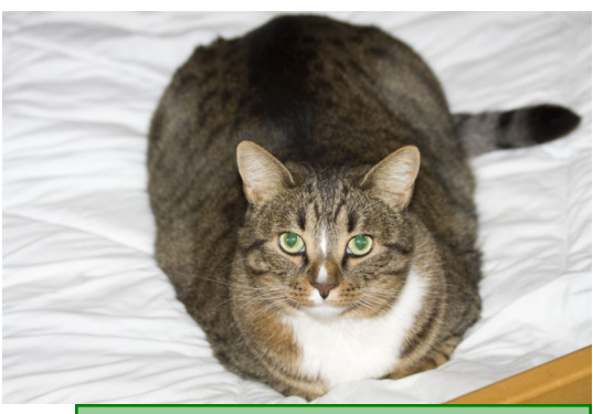
Gus's Quote for 2009: You can keep a dog; but a cat keeps people, because cats find humans useful domestic animals.

I want to go visit my grandparents and sit in the sun out on their deck. Grand-dad always feeds me a lot of treats