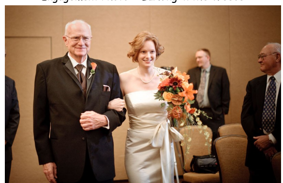
Down the Aisle!