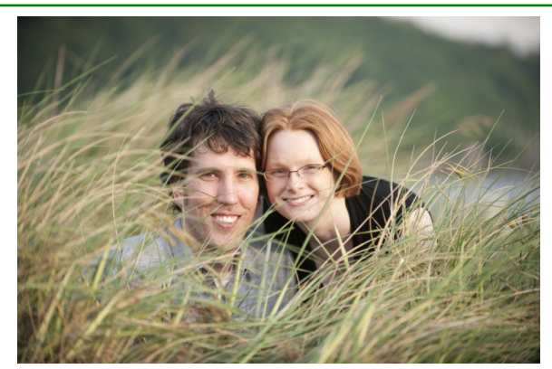
Engagement Photo—"Lurking in the Weeds"

If you want to see more, log on to our web site brownransomfamily.org.