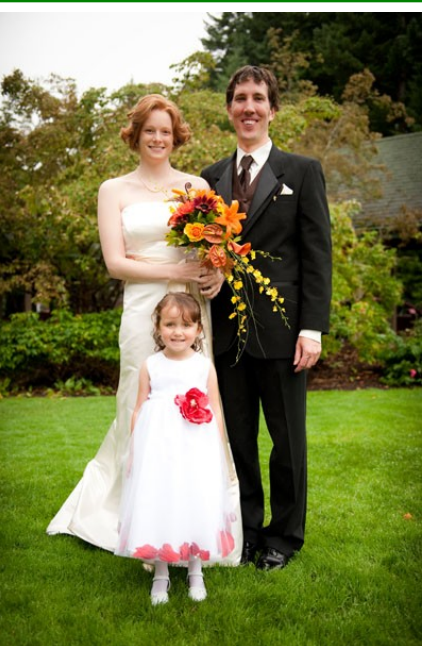
Before the Ceremony