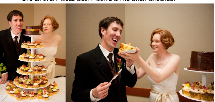
For Some, the Best Part Was the Cake