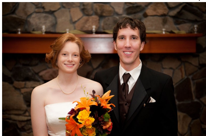
It's all over. Does Scott look a Little Shell-Shocked?